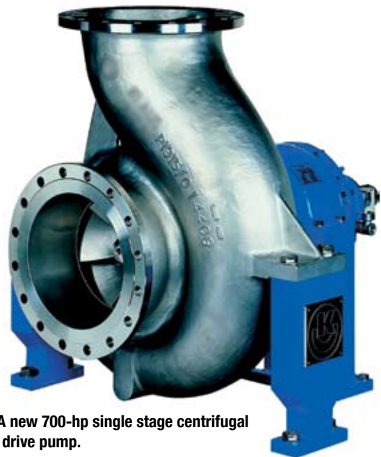
Figure 2. A new 700-hp single stage centrifugal magnetic drive pump.

State of the art magnetic drive pumps now exceed driving power of 700-hp, flow rates of 15,000-gpm, delivery heads of 3,000-ft TDH, system pressures of 3,000-psi, operating temperatures of 840-deg F without external cooling, and viscosities of over 3,000-cPs. Solutions for more challenging