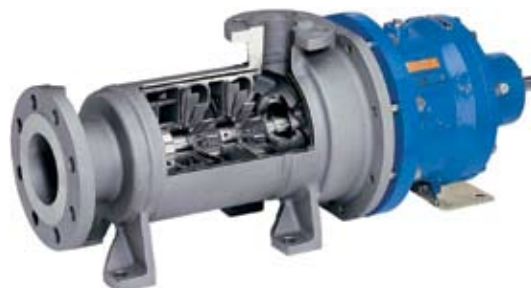
Figure 3. A self-priming multistage side channel magnetic drive pump.

Boris Nitzsche is vice president of Klaus Union, Inc., 15410 Lillja Road, Houston, TX 77060, 281-999-1182, Fax: 281-999-1185, www.klausunion.com, bnitzsche@klausunion.com.