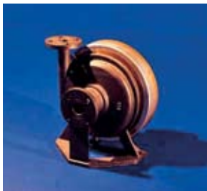
Figure 1. A magnetic drive pump from 1958.

Figure 1 shows one of the first magnetic drive pumps. No housing was used to cover the outer magnet ring, and the outer diameter of the driving magnet ring far exceeded the diameter of the hydraulic casing.