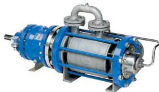
Figure 4. A multistage centrifugal magnetic drive pump for high delivery heads.